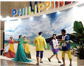
In addition, a photo exhibition and a 3D ART photo zone will be provided for visitors to see the local image of the Philippines.