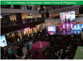
The Philippine Ministry of Tourism will hold the Philippine Cultural Festival "Feel the Phil" for three days from October 25 to October 27, in honor of the 70th anniversary of diplomatic relations between Korea and the Philippines.

Proceed with Philippine Tourism Department and Seodaemun Government. At this festival, you can see various cultural performances and taste traditional Filipino food. In addition, various events can be provided free of charge for anyone to participate.